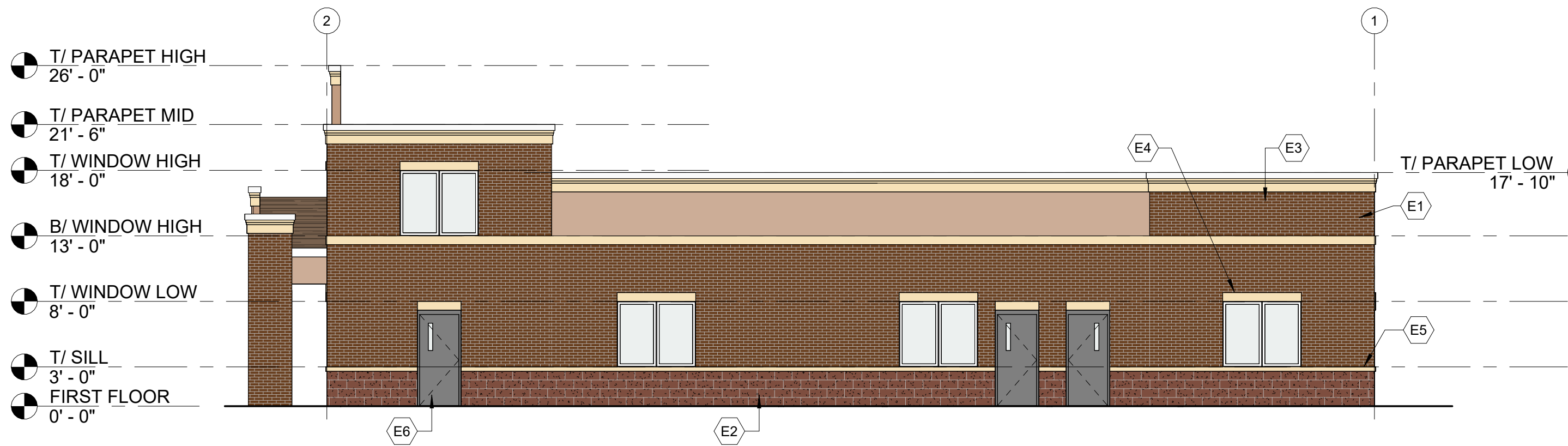
4 RIGHT ELEVATION 1/8" = 1'-0"