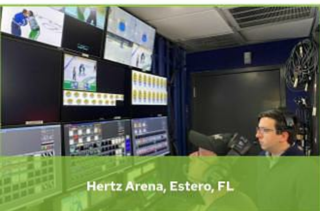
Hertz Arena, Estero, FL