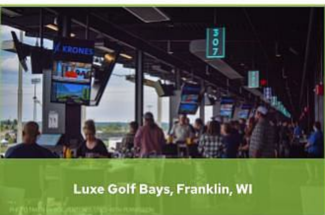
Luxe Golf Bays, Franklin, WI