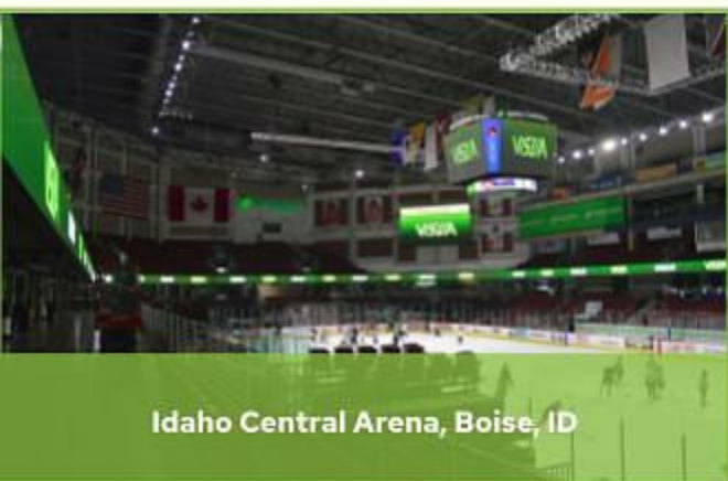
Idaho Central Arena, Boise, ID