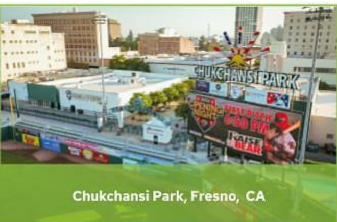
Chukchansi Park, Fresno, CA