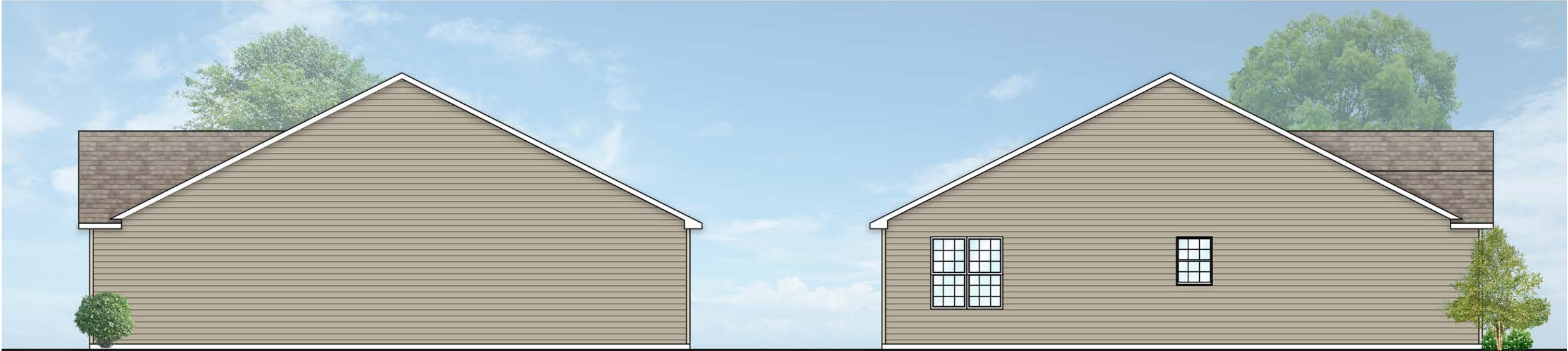
Elevation A - Side Elevation