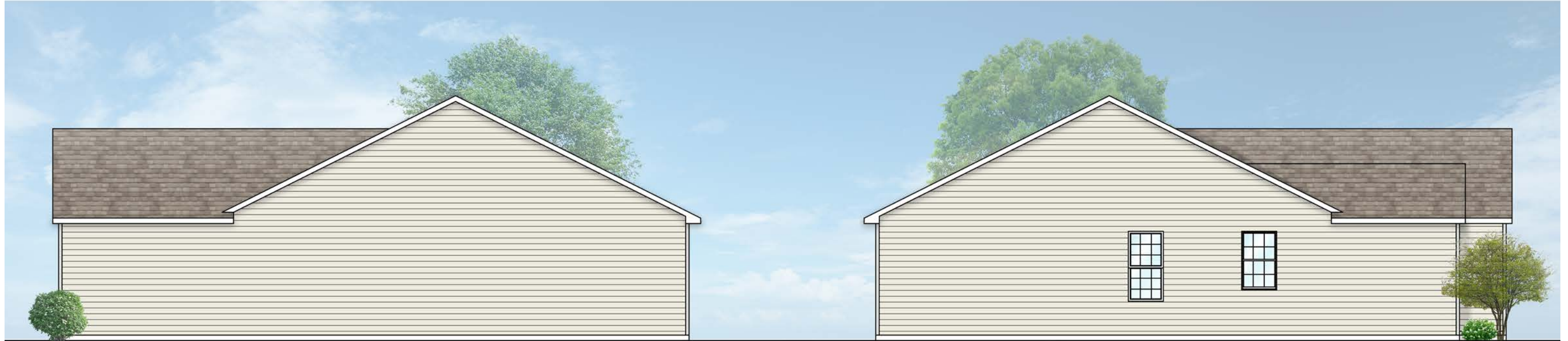
Elevation A - Side Elevation