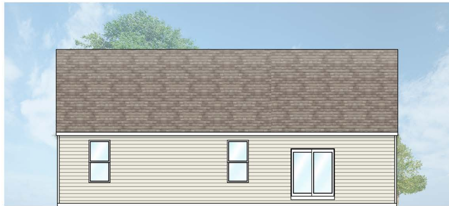
Elevation A -Rear Elevation