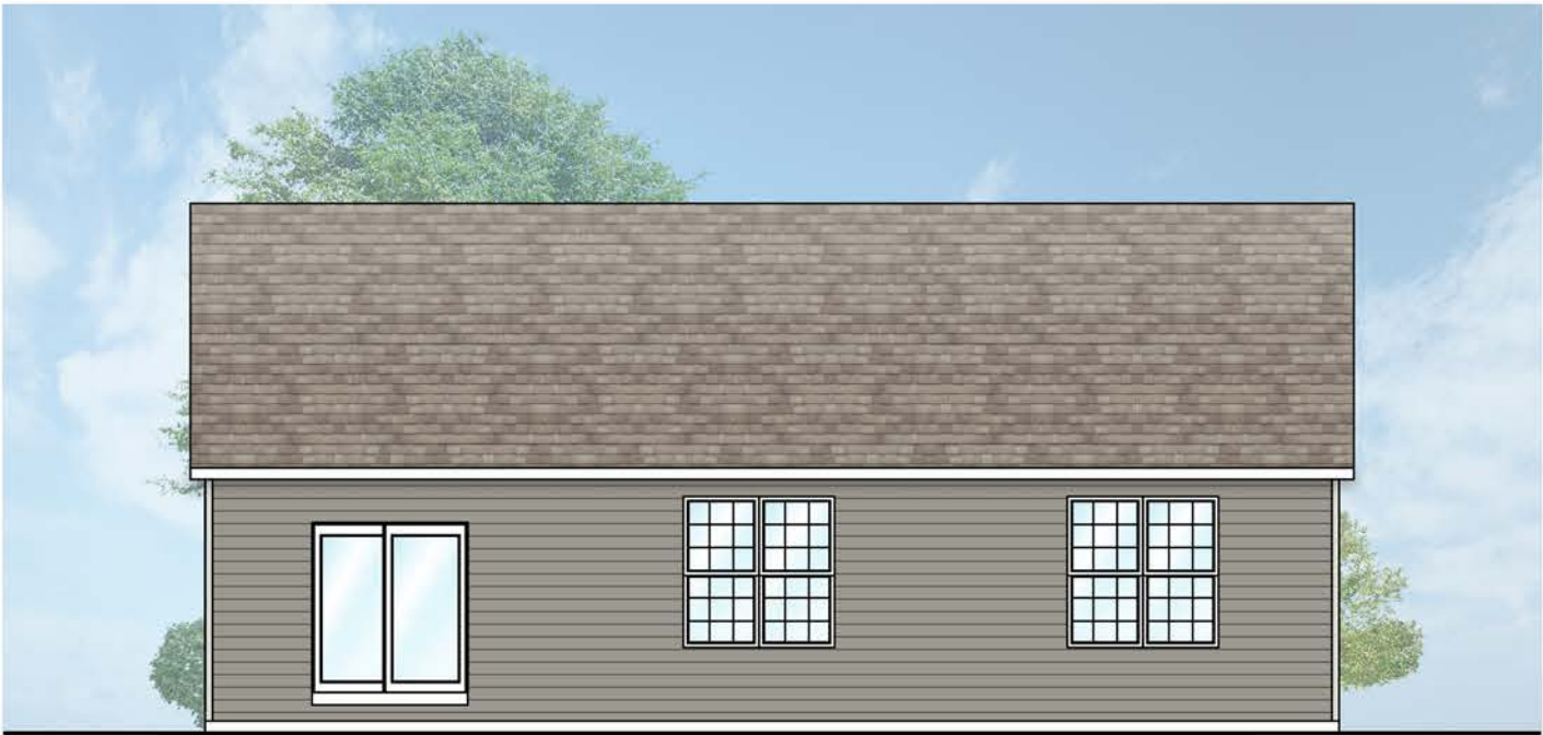
Elevation A -Rear Elevation