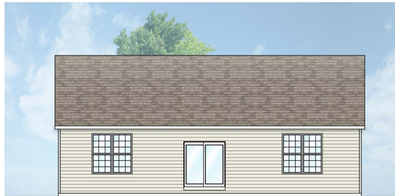
Elevation A -Rear Elevation