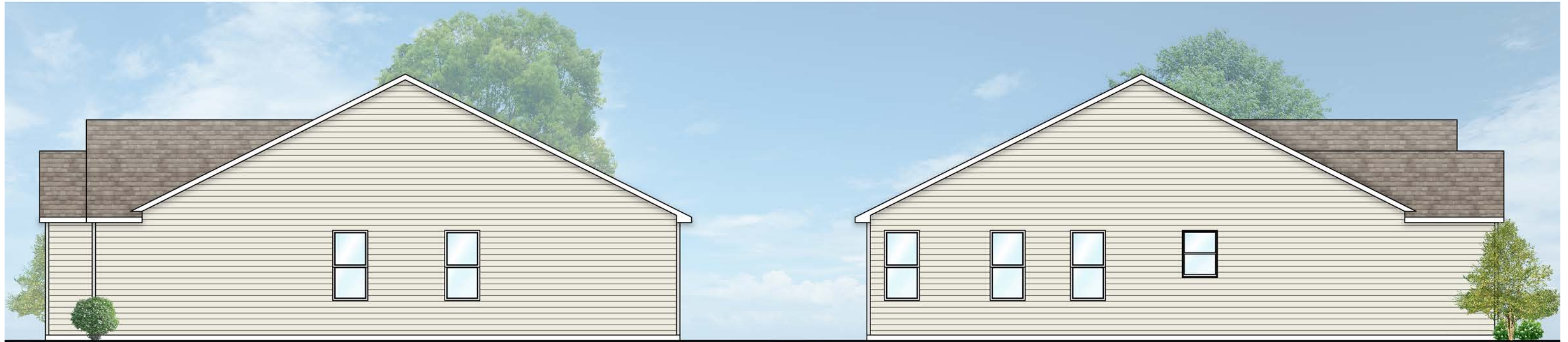
Elevation A - Side Elevation