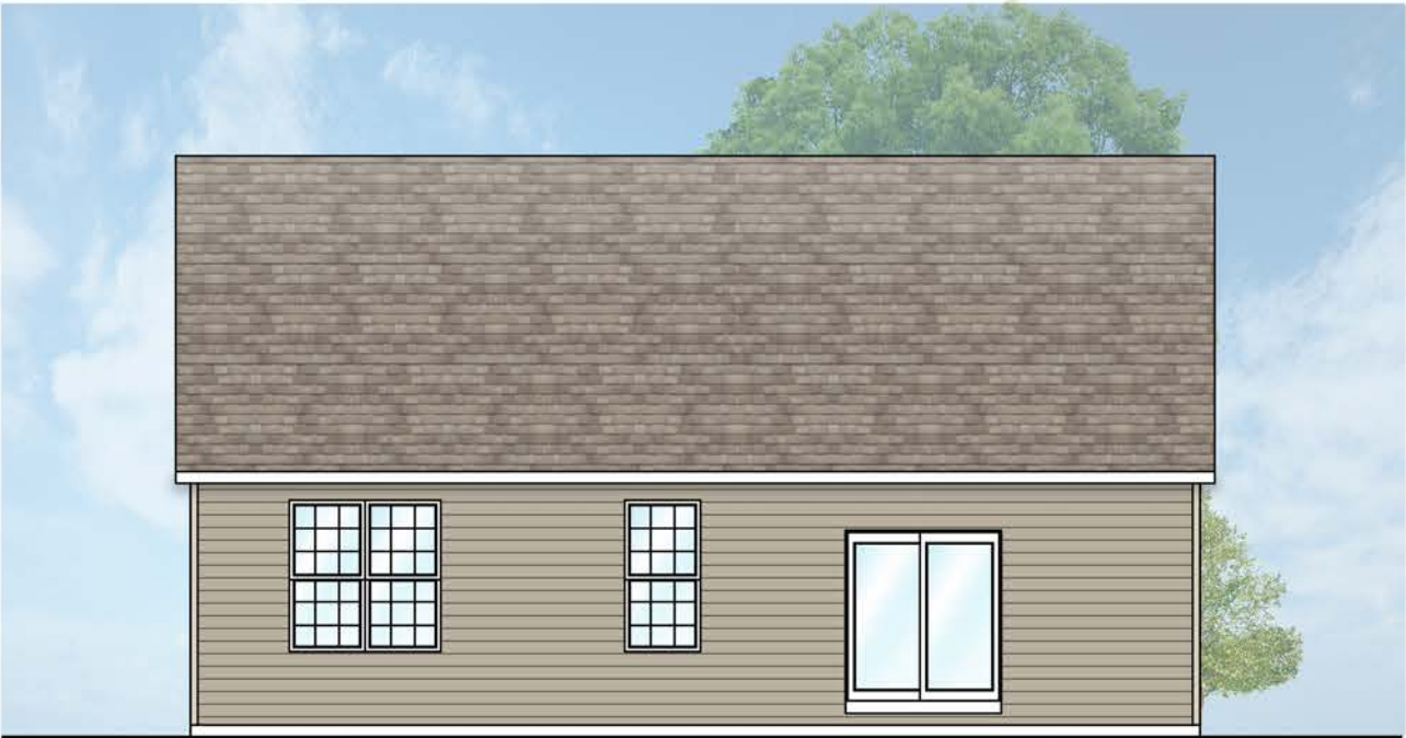
Elevation A -Rear Elevation