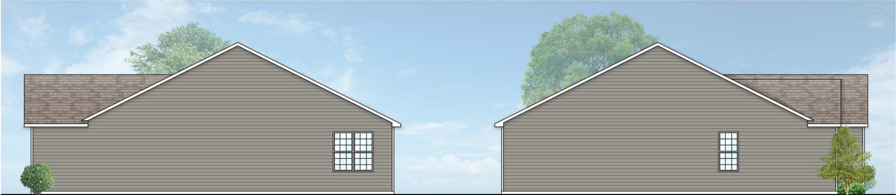
Elevation A - Side Elevation