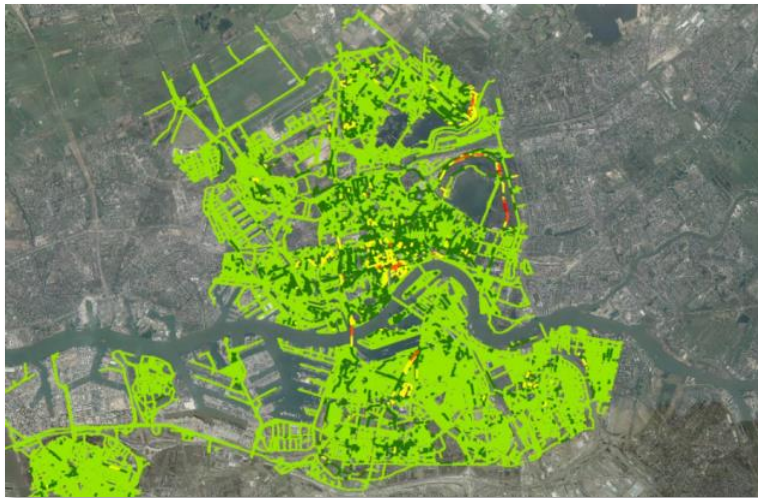
Figure 1: Green shows high positional accuracy, red is poor positional accuracy due to minimal GPS/IMU signal under urban canyons and dense vegetation.

The Final Delivery Report provides the Customer with a summary of the overall miles driven, areas collected and positional accuracy of the recording points. Each GeoCyclorama has associated metadata with information on the date and time it was captured, the accuracy of the recording point, the spatial reference system, and camera system information. The accuracy of each recording point is reported to the Customer geographically in a heat map as Figure 1 below demonstrates.