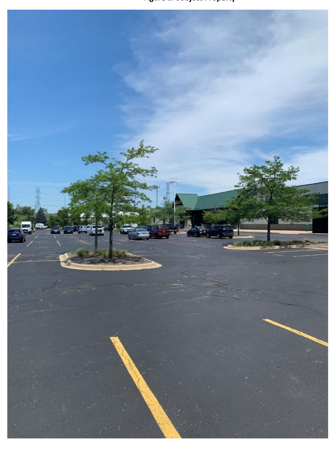
Figure 1: Subject Property