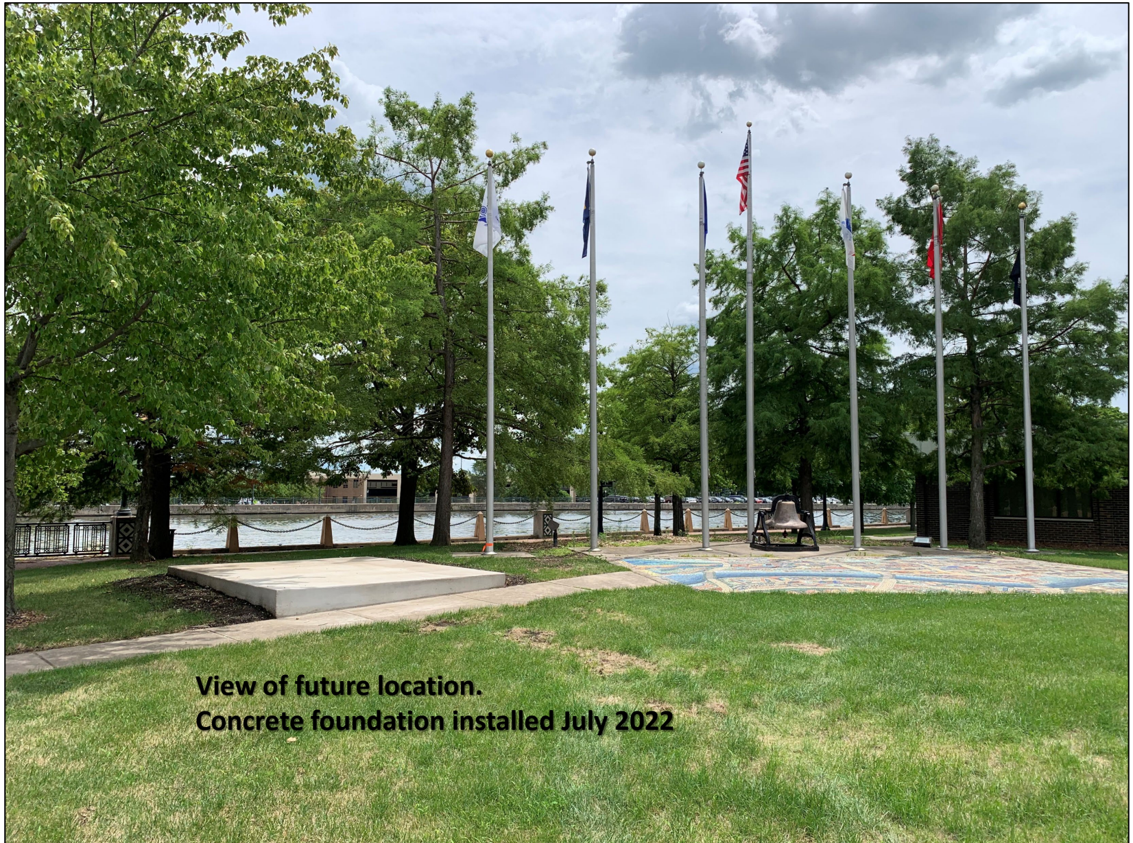
View of future location. Concrete foundation installed July 2022